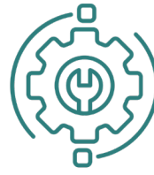
FINANCIAL AND TECHNICAL CONSTRAINTS