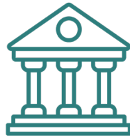
WEAK DATA GOVERNANCE FRAMEWORKS