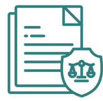
CULTURAL AND LEGAL BARRIERS